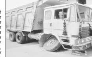
अन्न टळले. तिन आठवी आवल्याने...